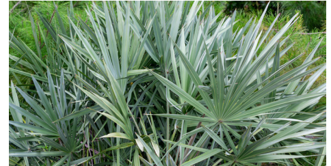
Silver Saw Palmetto

Your eyes aren't playing tricks on you! These silver palmettos are native to Florida.