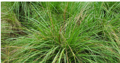
Dwarf Fakahatchee Grass

During spring and summer, rust colored flower spikes stand just slightly taller than the green foliage.